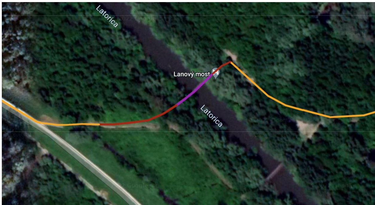
Obr. 2. The situation of the location of the existing footbridge over the Latorica river