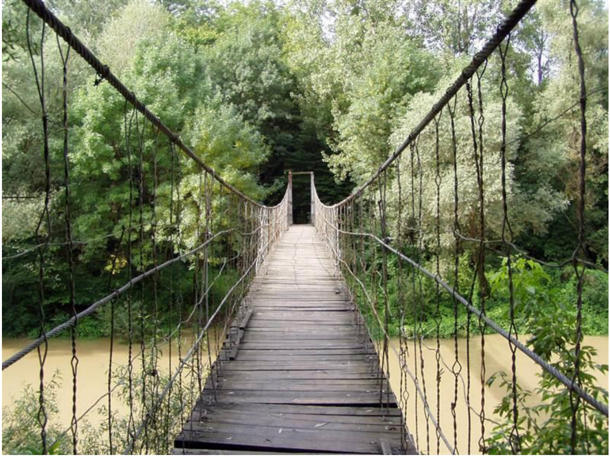
Obr. 3. photo of the current condition of the suspension bridge